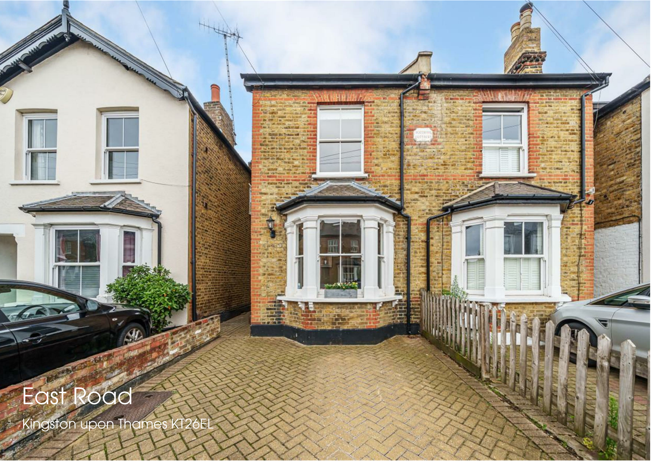
East Road Kingston upon Thames KT26EL